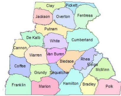
White County Seat - Sparta

Superintendent of Roads 1900 Roberts Matthews Hwy. Sparta, TN 38583 Phone: (931) 738-2110 Fax: (931) 738-2110 cohighway@blomand.net Elected 2010