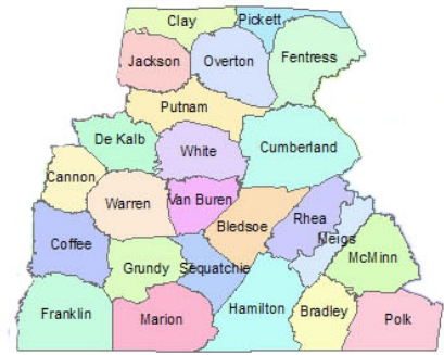
Van Buren County Seat - Spencer