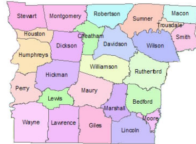
Perry County Seat - Linden

Highway Superintendent P.O. Box 38 Linden, TN 37096 Phone: (931) 589-5217 Fax: (931) 589-5217 perrycountyhwy@yahoo.com Elected 2010