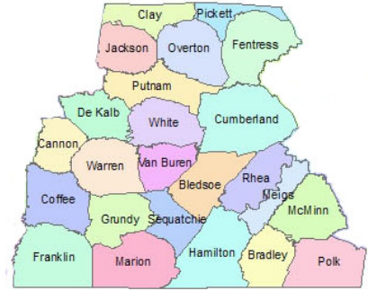
Franklin County Seat - Winchester

Highway Superintendent 207 S. Cedar St. Winchester, TN 37398 Phone: (931) 967-2755 Fax: (931) 962-4497 jwoodall@franklincotn.us Appointed 1994