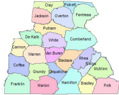
Clay County Seat - Celina

Highway Commissioner 1199 Walnut Ave. Celina, TN 38551 Phone: (931) 243-2611 Fax: (931) 243-2248 clayhighway@twlakes.net Elected 1990